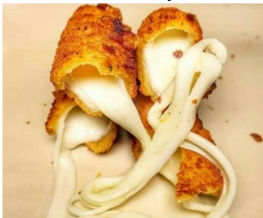
Figure 2 Rissoles

This Angel's Moonlight has a difference from the normal moonlight, which includes its shape, appearance, taste, texture, and presentation.