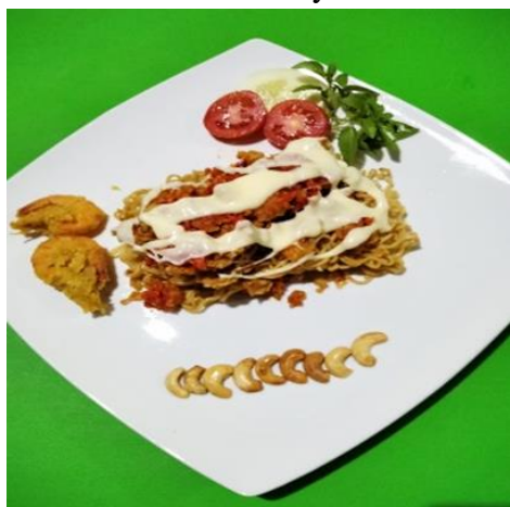
Figure 3 Special Geprek Chicken Noodles

The special mayo rissoles have an advantage compared to the usual mayo rissoles because they have a characteristic taste of continental dishes with mozzarella, oregano, leaf flavors, and tobacco sauce ordered directly / cooked or frozen.