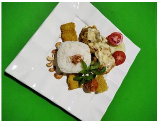
Figure 1 Bright Moon

This Angel's Moonlight has a difference from the normal moonlight, which includes its shape, appearance, taste, texture, and presentation.