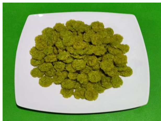
Figure 4.5 Rengginang crackers

Geprek Chicken Rice with Honey Sauce has the advantages of ordinary Geprek chicken rice, where this special Geprek chicken rice has the taste of Indonesian and continental cuisine. This geprek chicken rice is complemented with mozzarella sauce, real honey plus fried tempeh, fried cashews, and chili sauce.