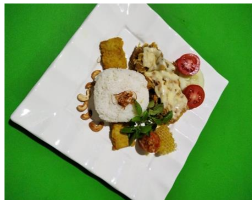
Figure 4.4 Geprek Chicken Rice with Honey Sauce

Chicken Noodle Geprek, cucumbers, and tomatoes.