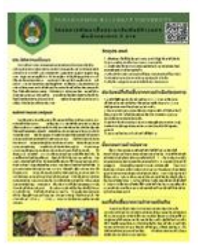
Fig.6. Examples of the implementation results