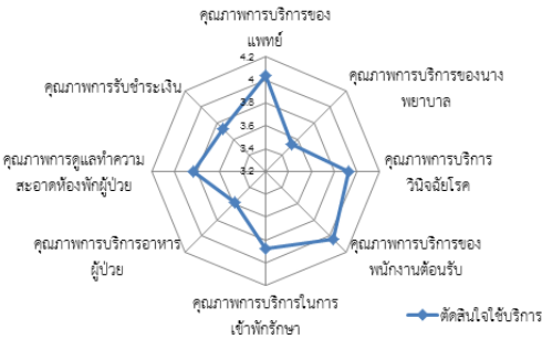
Figure 1: Service quality affecting the decision to use services in private hospitals

foods, service quality of cleaning in patient rooms, and service quality of payments, from figure 1.