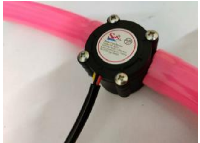
Water flow sensor

The sensor is set at the water source channel or at the launch of the pipe. The sensor contains three wires. Red wire to associate with flexibly voltage. Dark wire to associate with ground and a yellow wire to gather yield from Hall impact sensor. For flexibly voltage 5V to 18V of DC is required.