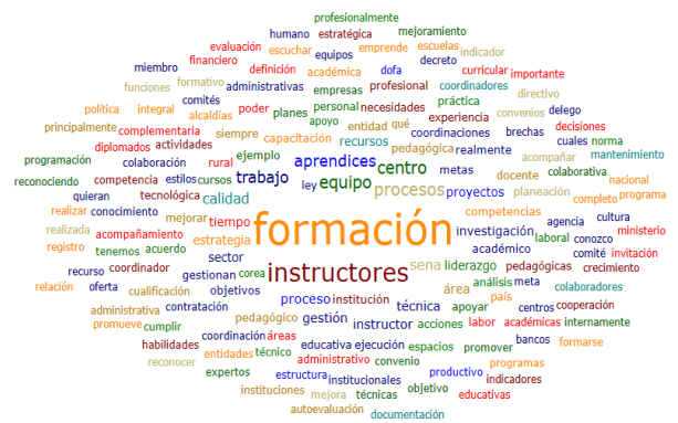
Fig 1. Word cloud Software Atlas TI V8.7.25

The following is a word cloud, which shows the key aspects most frequently mentioned in the participants' answers to the questions that made it possible to respond to the research objectives, including training, instructors, apprentices, processes, work, quality, team and leadership..