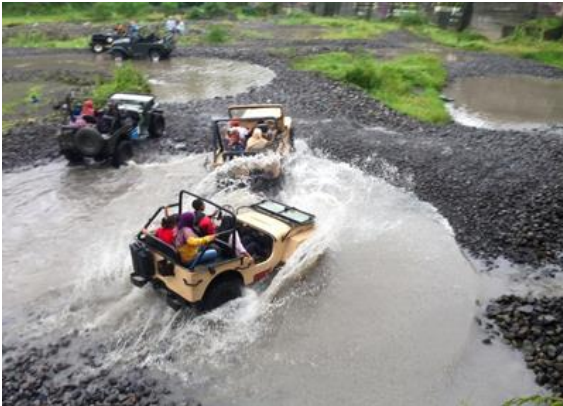
Figure 5. Business of Jeep Lava Tour Turism

Beside they becomes sand and rocks manner, they also become breeder, especially dairy cow and beef cattle. Then, they also sale the milk that collected by local village cooperative (KUD) with price Rp. 2000,- per liter. In one day they can supply two times with the average in each supply is 5-10 liter per (Pyles, 2011; Sajogya, 1977; Setyowati, 2014).