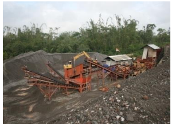
Figure 3. The Rocks Minning Place as Raw Material of Block Making in Umbulharjo, Cangkringan

Tour and as lobar of sand and rocks minning in dry season (Pyles, 2011).