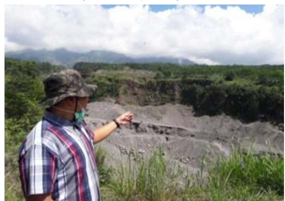
Figure 4. Parnennial Sand Dunes in Desa Petung, Cangkringan

Local material availability in Cangkringan can fulfill the need of material for local society. This eruption materials then collected by society then they make it as block, mortar, and materials for plaster floor. Many of local material like big rock, small rock and sand are from Merapi eruption, collected by society as local material business whether in the raw form or mature form, like block, roaster and etc (Permana, 2017).