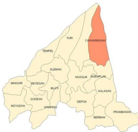
Figure 1. Cangkringan Area Map

Cangkringan is district in Sleman regency of Yogyakarta. Cangkringan area has its attractiveness because it's place that drained with big rivers that produce many sand and rocks like Opak, Gendol, and Kuning rivers. Sand and rock in Cangkringan is from material of Merapi eruption so until nowadays society has perception that Merapi eruption is a gift and not a threat. Geographic location of Cangkringan that has potential to produce sand and rocks so this area can develop as Industrial area (Permana, 2016; Permana, 2017; Eickelman, 1978; Glenn, 2013).