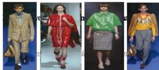
Figure 1: women and men's fashion images

In this paper we examined the preferences of Asian(male and female) university students' in regards to "unique" designer fashions. In order to stay aligned with previous studies, we used photo elicitation to evoke information, along with research questions which pertained to individual preferences. Photo elicitation is the insertion of a photograph in interviews, as previously mentioned, it reinforces the role of the viewer. In this study we incorporated an electronic questionnaire to draw meaning (Rothenberg & Valente, 1996). We used idiosyncratic and rare fashion pictures to make inferences on the selective process of the participants. The photos were ascertained from the W-fashion 2018 issue. The W-Magazine is a magazine that features stories about style through the lens of culture, fashion, art, celebrity, and film. According to Stets (2006) it is believed that images evoke deeper elements of human consciousness compared to text, this is a partly due to the age of brain parts that process visual information. Because this is a small ethnography study, we chose the four photographic samples.