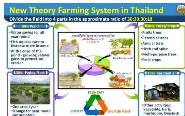
Figure 3. Layout of New Theory Farming System based on Sufficiency Economy Philosophy [24]

Through HM King Bhumibol Adulyadej's on-field research, it suggests small farm management to ensure food security and protect farmers from droughts and debts from fluctuating prices and offers the model of small farm management called "New Theory" based on Sufficiency Thinking. For short, the New Theory suggests farmers to divide their plots into four sections under the 30:30:30:10 formula. Farmers should use 30% of land for a reservoir to ensure year-long water supply for farming, another 30% for rice fields, another 30% for vegetables, field crops, fruit trees, firewood, herbs, etc., and the remaining 10% for residence and livestock areas. (Figure 3) The required size of land to ensure self-sufficiency should be around 10-15 rais (4-6 acres or 1.6-2.4 hectares) [22]. After achieving food security, the second stage of the New Theory advises farmers to get organised to improve their irrigation systems and farm productivity and collaborate each other for better produce, process and market their goods, preferably as co-operatives. They also should share resources to provide welfare benefits to members. Stage Three concerns the establishment of fair trade relationships between local organisations and the private sector [23].