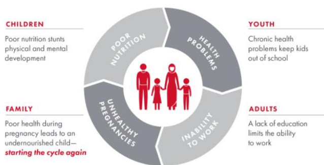
Figure 1. The cycle of hunger [3]

Hunger is the painful sensation caused by lack of food. people who get less than 1,800 calories of food per day is considered undernourished. The problem of hunger can include malnutrition, both undernutrition, meaning lack of energy and essential nutrients, and overnutrition, caused by unbalanced diets. Food insecurity concerns food availability, food access, and food utilization [4].