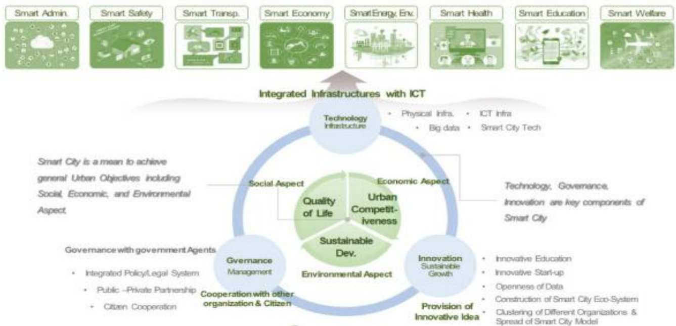
Figure 1. The renewed smart city concept in Korea [7]

city concept in Korea expanded to meet the perceived global standards of smart cities (Figure 1) [6].