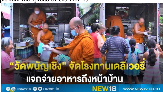
Fig.3 Temples in Phra Nakhon Si Ayutthaya Province has established a cooked dining hall distributed to people in the community area near the temple.

(2) The role of being the center in providing assistance to the people in which temples and monks have established a donation center to assist people in consumer goods, rice, dry food and necessary utensils, such as masks, washing gel, to prevent the spread of COVID-19.