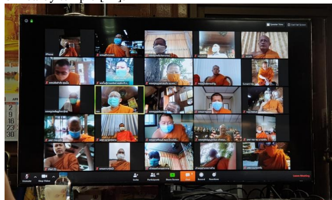
Fig. 4 Effects on the monks in the administration of the clergy have a meeting through online system to help each other and help people in the COVID situation

(4) Role in community modeling in promoting sufficiency under difficult circumstances. Buddhism has principles or the concept of patience including promoting temples in Phra Nakhon Si Ayutthaya Province as food production sites that is to use the free space as a food production source create a garden for agriculture, grow organic vegetables to use as a cooking appliance and distribute to people in the temple area or nearby temple [14].