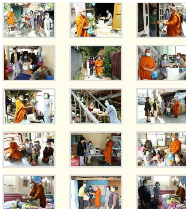
Fig. 5 Roles of temples and monks in Phra Nakhon Si Ayutthaya Province have established a diner to distribute cooked food and give away consumables consuming for bed-bound patients

(Source: Watyaichaimongkol Ayutthaya, 30 June 2020)