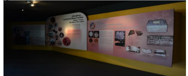
Fig.8 Display room sign

Room 1 has shown the historical development of the land of Suvarnabhumi, important commercial sources of the ancient world and trade between various ancient communities both inside and outside with antiques and media exhibits various types of modern.