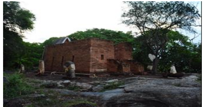
Fig.2 small old temple

On top of wat khan tham thiam has a cave. Which was received in 1928. If you walk up to the top of that you will find a small old temple with a door into one side. Near each other there is a chedi in the Ayutthaya period and as a point to watch the sunset as well.