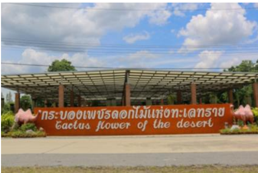
Fig.16 Cactus flower of the desert

In the center has been annual plant-related activities such as the Tulip festival in January, Rose festival in February, Lotus festival in June, Siamese flower festival in August, Sunflower festival in December etc.