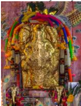
Fig.11chao pho phrayachak

In the middle of the night on August 29, 1967, a fire at the shrine. But idol of Vishnu was not damaged. Causing the villagers in that area to have faith. Worshiping brings happiness, good trade and a safe journey.