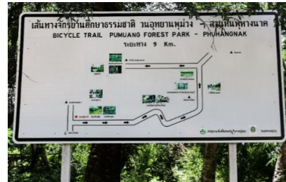
Fig.18 Bicycle trail pumuang forest park- phuhangnak

Phumuang forest park with an area of approximately 1,725 rai, the area has been a mixed deciduous forest alternating with bamboo ruak. Within the forest park, there have interested things, such as the nature trail, a distance of 1.50 kilometers and takes about an hour and a half to walk.