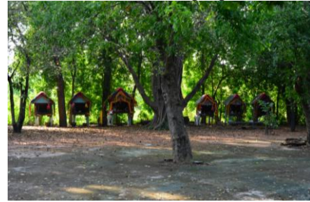
Fig.13Ho chaw nai

an open courtyard at the front and the end there has been big trees. Near has been the location of 7 small shrines, arranged in a row in front of the board. ho chaw nai has been a place to seize the minds of the ban khok people.