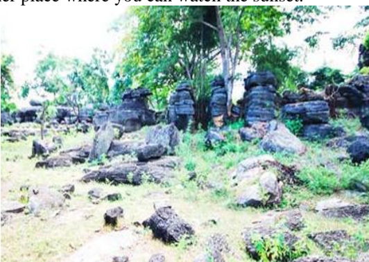
Fig.17 Phu hang nak rock park

3.2 Phu hang nak rock park Phu hang nak rock park has been an ancient stone garden that has been tens of thousands of years old. The garden has been naturally beautiful. Stone shapes and patterns can be imagined in various shapes. According to the idea of tourists. On the hill a spring comes out. Has a meander-like appearance. Then flow together to form a source of water has called huai hang nak. This is another place where you can watch the sunset.