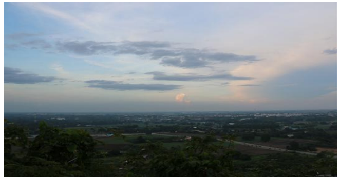
Fig.3 Sunset point