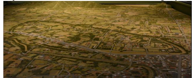
Fig.9 Ancient U Thong City Plan

Room 2 has shown simulate the maritime trade event from the Indian Peninsula to the land of Suvarnabhumi some 3,000 years ago, the maritime of foreign merchants and major trade routes and port at that time. Which has believed that part of the trade route with the ancient u-thong city.