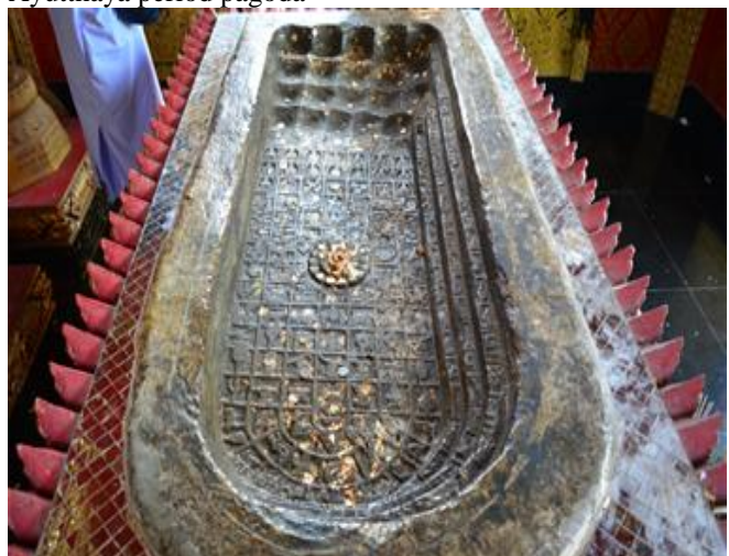
Fig.4 the buddha's footprint

Located on winyanuyokrd, u-thong subdistrict, u-thong district, suphanburi province. It was old temple has existed since the Dvaravati period. Before u-thong city flourished. There were also old objects. Many pieces were evidence in the composition, such as buddha amulets, phirod Buddha amulets, reclining buddha images, hermit images as a form of Dvaravati. Most of them were broken, leaving only the heads. Some buddha image had not head. The collected part was collected from the back of the great reclining Buddha. Which the general villagers call "loung pho sang sisanphet" On top of Wat khao phrasisanphetchayaram has phramonthop enshrines a replica of the buddha's footprint made from natural green stone and the remains of 1 Ayutthaya period pagoda