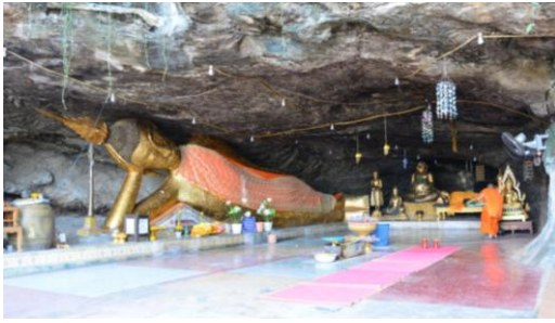
Fig.5 loung pho sang sisanphet