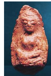
Fig.10 Ancient Terracotta Monks

Located on chorakhesam phan subdistrict, u-thong district, suphanburi. Wat khao thamsua has sacred archaeological site. Which was before Wat khao thamsua. This area has unearthed many ancient pagodas. In which each chedi has had many valuable antiques. Currently, only the base of the pagoda cannot be assumed. The cause of the collapse has come from two reasons: 1) from time and 2) human destruction due to excavation of antiques in the pagoda, but with a quiet atmosphere and it has been good place for meditation. Causing monks has come to Buddhist lest in order to practice themselves until the creation of a monastery.