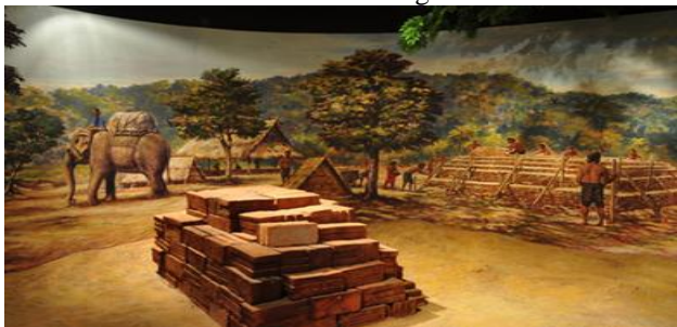
Fig.6 Agricultural society

Room 1 has been a room that exhibits prehistoric antiques and the development of the ancient city u-thong. Which found evidence of human habitation since prehistoric. Society during that time was an agricultural society. It has been considered to be during the Neolithic period and continued to the metal age. And ancient evidence that has shown u-thong ancient city used to be a major trading hub for the ancient communities in the region.