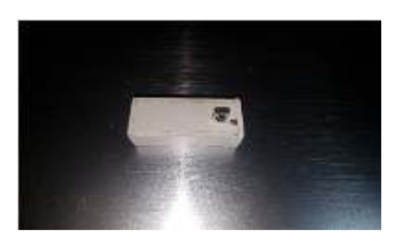
Hình 8. Module nhận dữ liệu

The model created by the authors is to prove that the data transmission by infrared is practical so currently only the receiver and transmitter modules are separate, not integrated and the same unit for duplex use or semi-duplex.