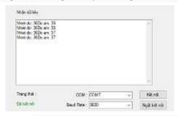
Hình 5. Windows forms interface to create applications to receive data via COM port

Windows Forms is a free, open source graphics class library included as part of Microsoft .NET Framework or Mono Framework, providing a foundation for writing rich client applications for desktops and laptops. hands and tablets. Use Windows Forms to create a simple application through which you can display data received through the COM port on your computer.