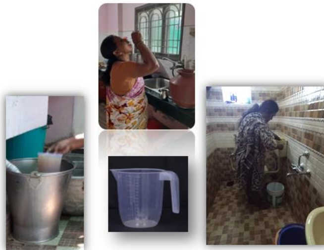
Figure 1: Measuring used water

With the measuring tools, a quantity of 10 liters of water was measured and kept aside the before day of the experiment for the purpose of cooking and the households were instructed to use the water for their next day’s cooking. The same procedure was followed for drinking purposes too. At the end of the day, water consumed for cooking and drinking was calculated by measuring the remaining water.